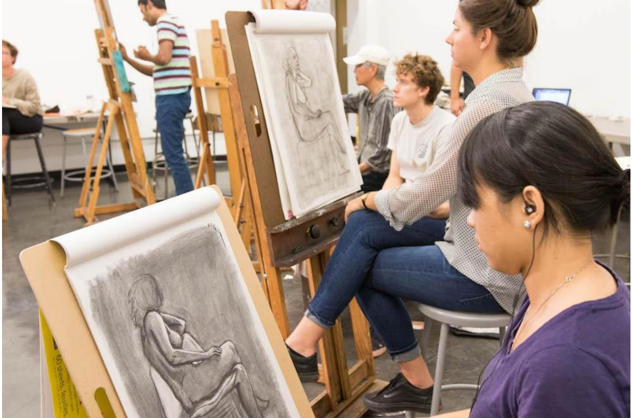
Maker's Space

Anchor House will also provide benefits to others in the campus and public communities: