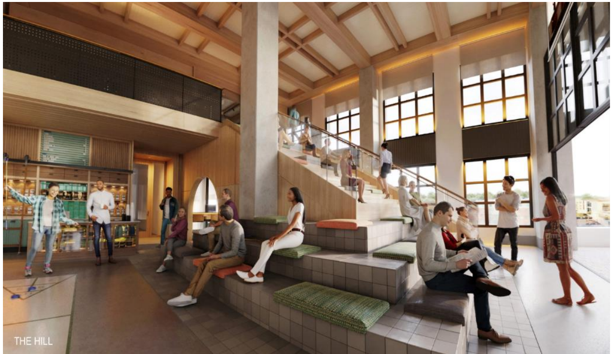
Spanish Steps, 2nd level

Other key guiding principles of the building design are well-being and education. Well-being is promoted by incorporating large windows to maximize natural light, as well as building amenities that foster healthy living: